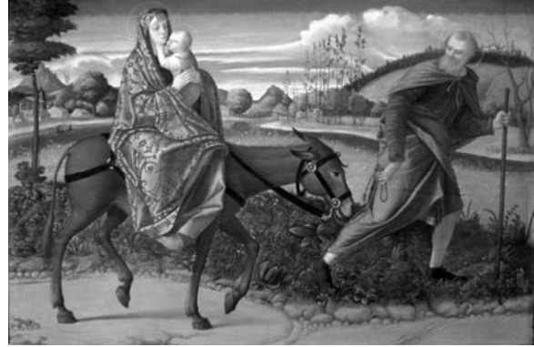
The Flight Into Egypt Vittore Carpaccio 1500 Oil on Canvas

Next, we learn the value of waiting. We don't know how long the Holy Family was in Egypt, but it must have been difficult to be refugees in a foreign land. If God has you on a personal detour